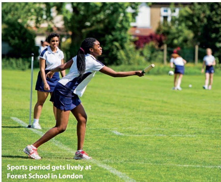
Sports period gets lively at Forest School in London