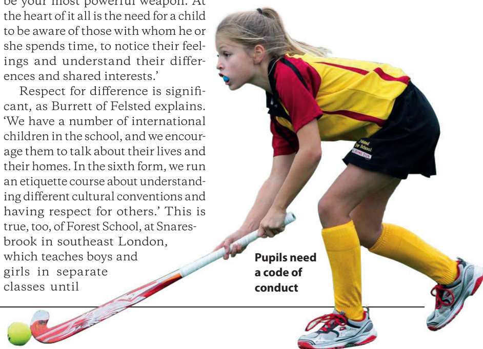
Pupils need a code of conduct

Respect for difference is significant, as Burrett of Felsted explains. 'We have a number of international children in the school, and we encourage them to talk about their lives and their homes. In the sixth form, we run an etiquette course about understanding different cultural conventions and having respect for others.' This is true, too, of Forest School, at Snaresbrook in southeast London, which teaches boys and girls in separate classes until