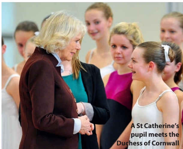
A St Catherine's pupil meets the Duchess of Cornwall

an extensive careers programme from Year 10, including careers-interest questionnaires, visits from key professions, and a careers convention supported by 50 Old Eastbournians. Sixth-formers receive guidance in course and institution choice, including overseas and vocational courses. An outside organisation provides interview practice with feedback.