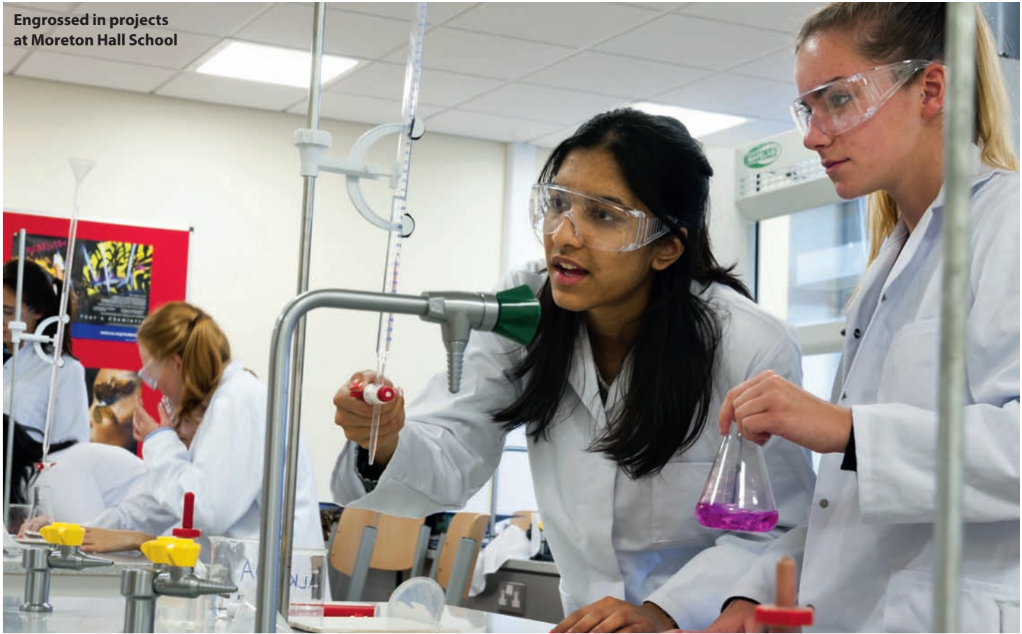
Engrossed in projects at Moreton Hall School