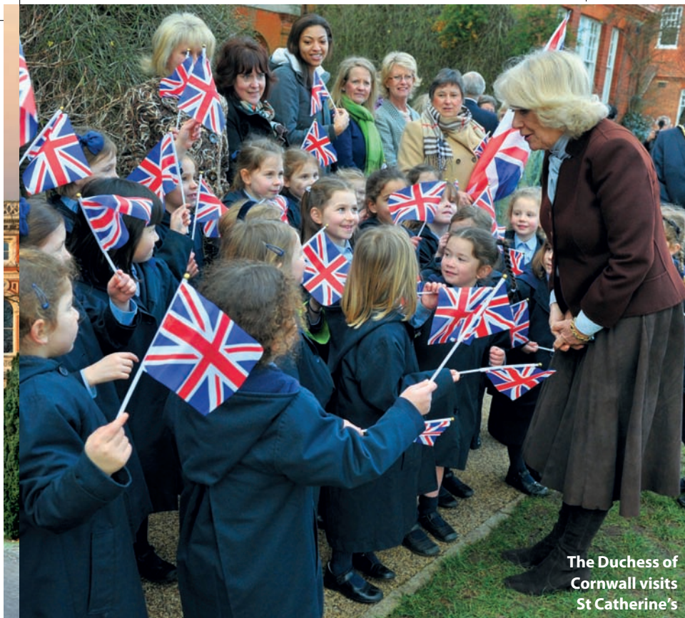
The Duchess of Cornwall visits St Catherine's