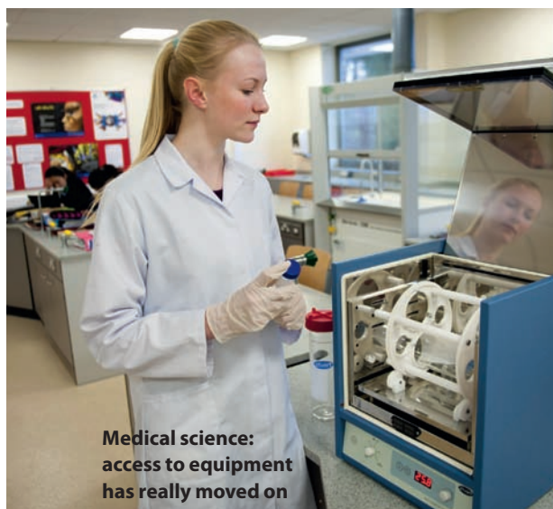
Medical science: access to equipment has really moved on