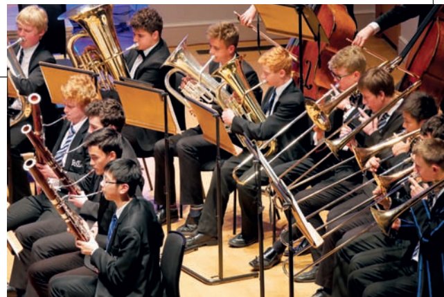
Dulwich College musicians (above) and King's College School, Wimbledon