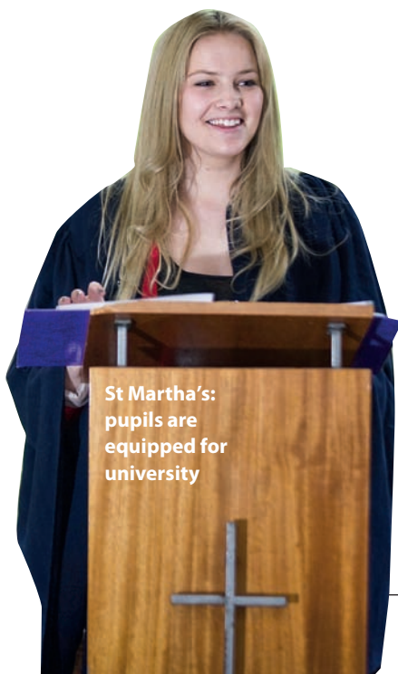
St Martha's: pupils are equipped for university

Choosing the right school is essential, but so is planning for the next stage of your child's life