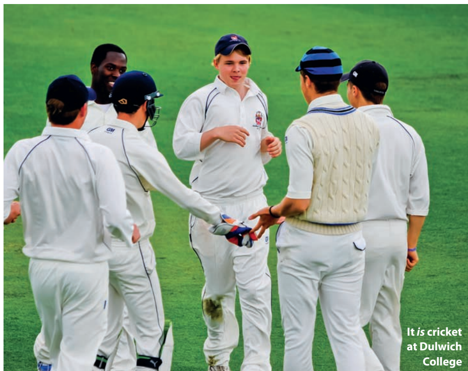
It is cricket at Dulwich College