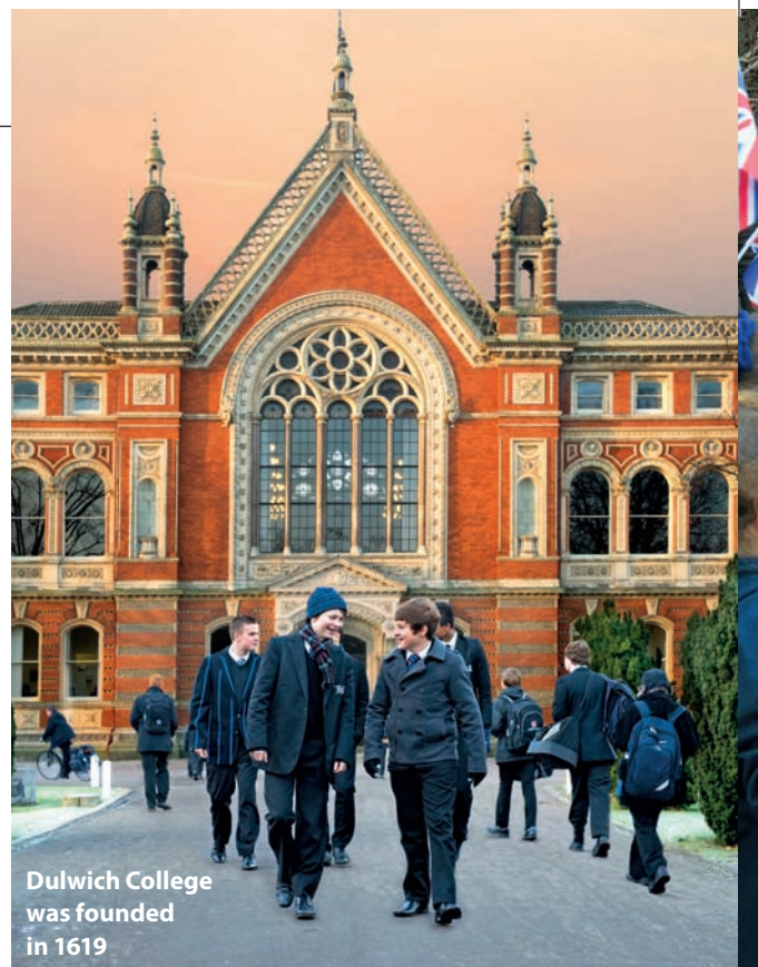
Dulwich College was founded in 1619