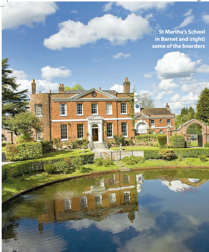
St Martha's School in Barnet and (right) some of the boarders