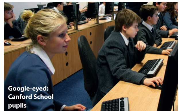
Google-eyed: Canford School pupils

'The problem with the latter, cheaper option, is of having a multitude of different sorts of devices in the classroom. There is absolutely no escaping the fact that we shall have to install a managed Wi-Fi system ▽