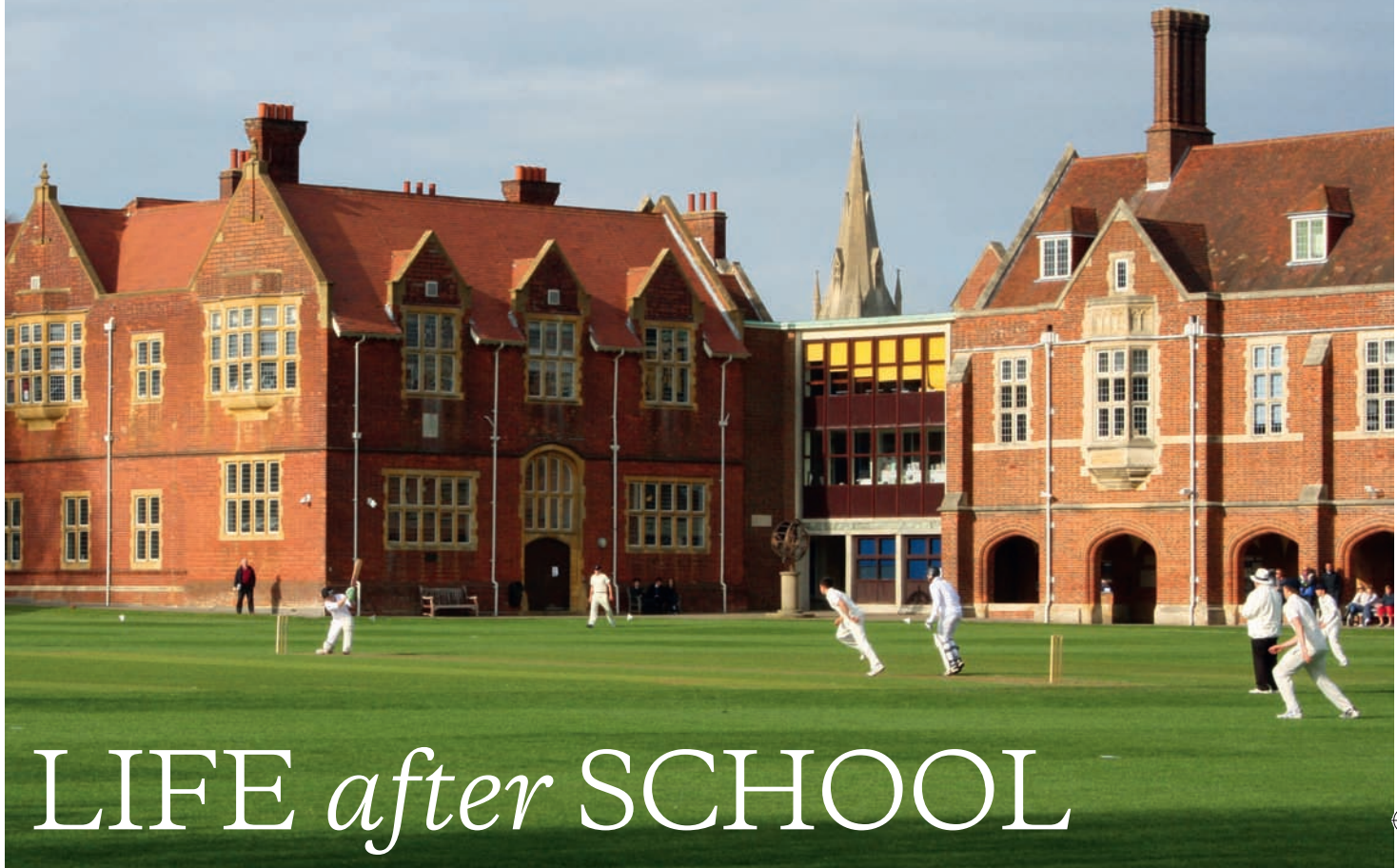
Eastbourne College – team spirit in action