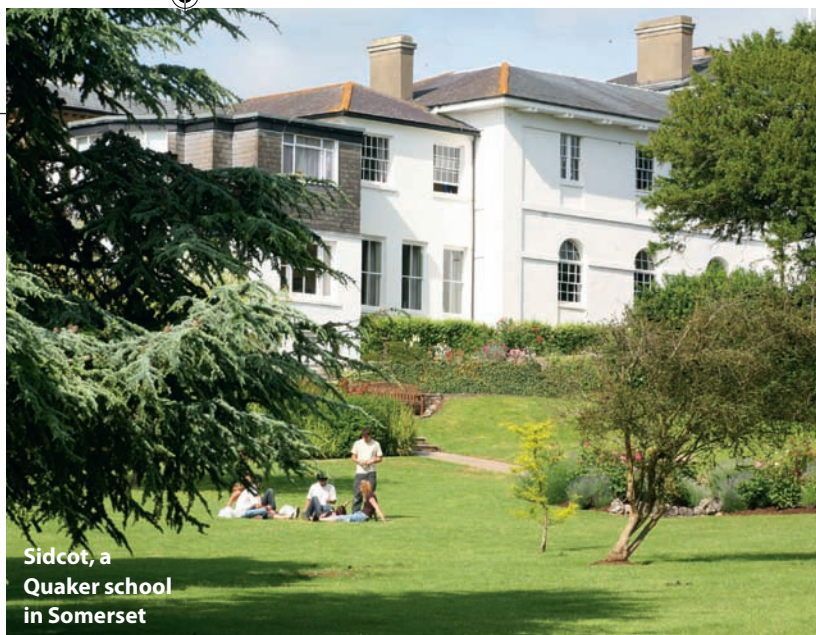
Sidcot, a Quaker school in Somerset

For this is really the essence of such initiatives at these schools. It may seem relatively trivial how