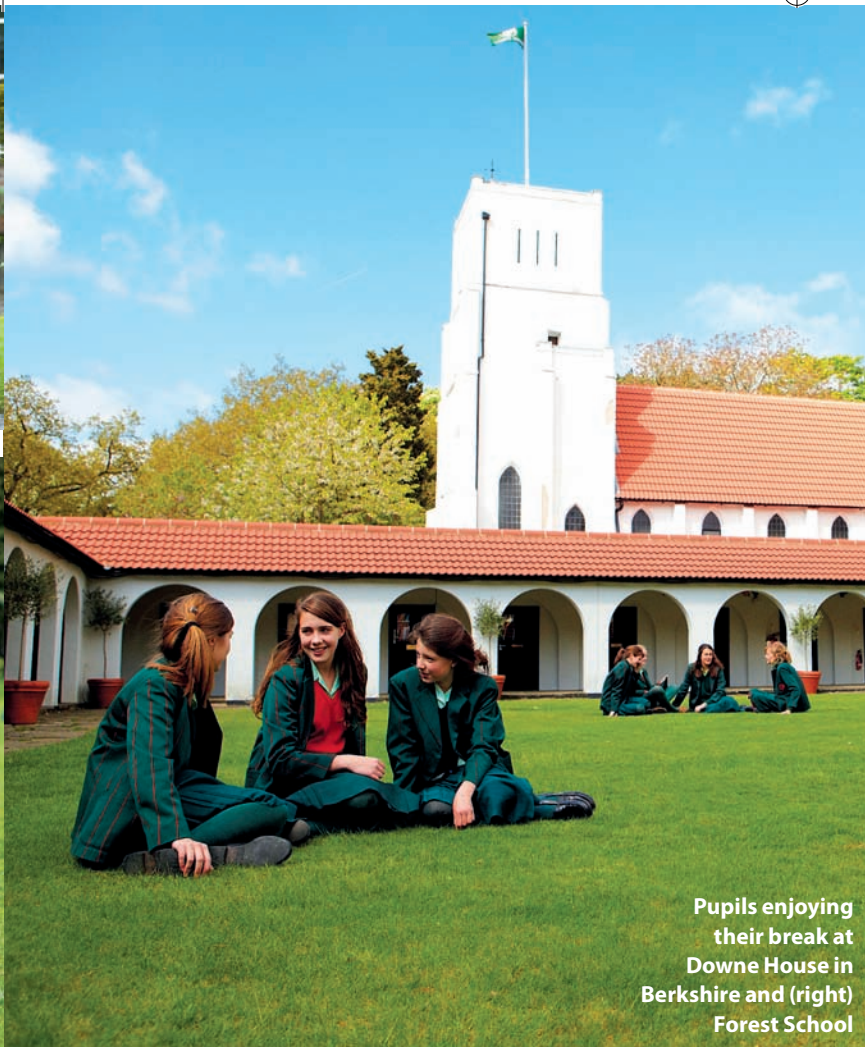
Pupils enjoying their break at Downe House in Berkshire and (right) Forest School